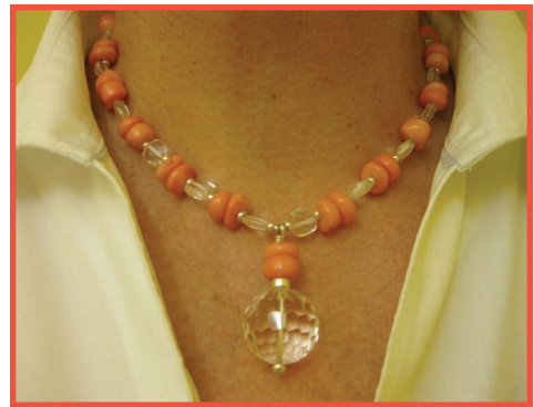
Pictured Right: Khalsa Trading Company, Coral Rock Crystal and Sterling Necklace.

REMEMBER YOUR MEMBERSHIP DISCOUNT WHEN VISITING THE MUSEUM SHOP, OPEN 7 DAYS A WEEK!